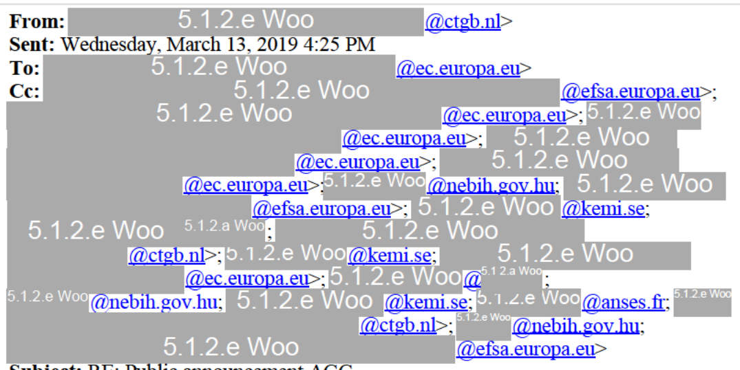
Subject: RE: Public announcement AGG

DG Health and Food Safety Unit E.4 – Pesticides and Biocides Tel.: +32-<sup>5.1.2.e Wool</sup> e-mail: <sup>5.1.2.e Wool</sup>@ec.europa.eu Web: http://ec.europa.eu/dgs/health_food-safety/